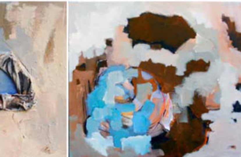
are Kept 2

Enjoy a life that is centered around making and creating no matter if it leads to financial success or not.