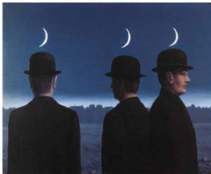
Rene Magritte, The Mysteries of the Horizon , 1955, Oil on canvas

Mild discomfort is a common initial reaction to anything new is. We can decrease the feeling of anxiety and become comfortable with something through repeated exposure; eventually it will become more familiar and less threatening, gradually leading to a more positive evaluation of the stimulus.