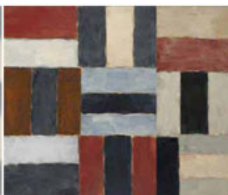
Chelsea Wall #1, 1999, Oil on canvas

You can do certain things with painting that are unique to painting that you cannot do with anything else.