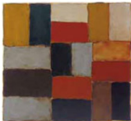
Red Merida, 2002, Oil on canvas